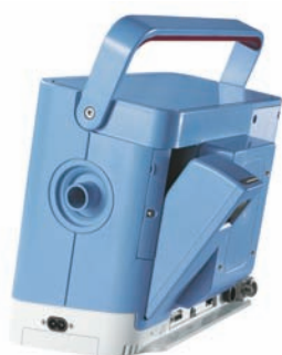
Trilogy100 features a detachable battery.

Managing home ventilator patients is challenging enough. So, the last thing you need is a complicated ventilator. Which is why the Trilogy100 provides easy-to-read, easy-to-navigate screens with clear, concise directions. It also has the option of displaying detailed readings for you or simplified screens for the patient and caregiver. Either way, Trilogy100's intuitive design allows for quick access to device settings and patient information. It also allows you to set dual prescriptions – one for daytime and a second for when your patient is sleeping.