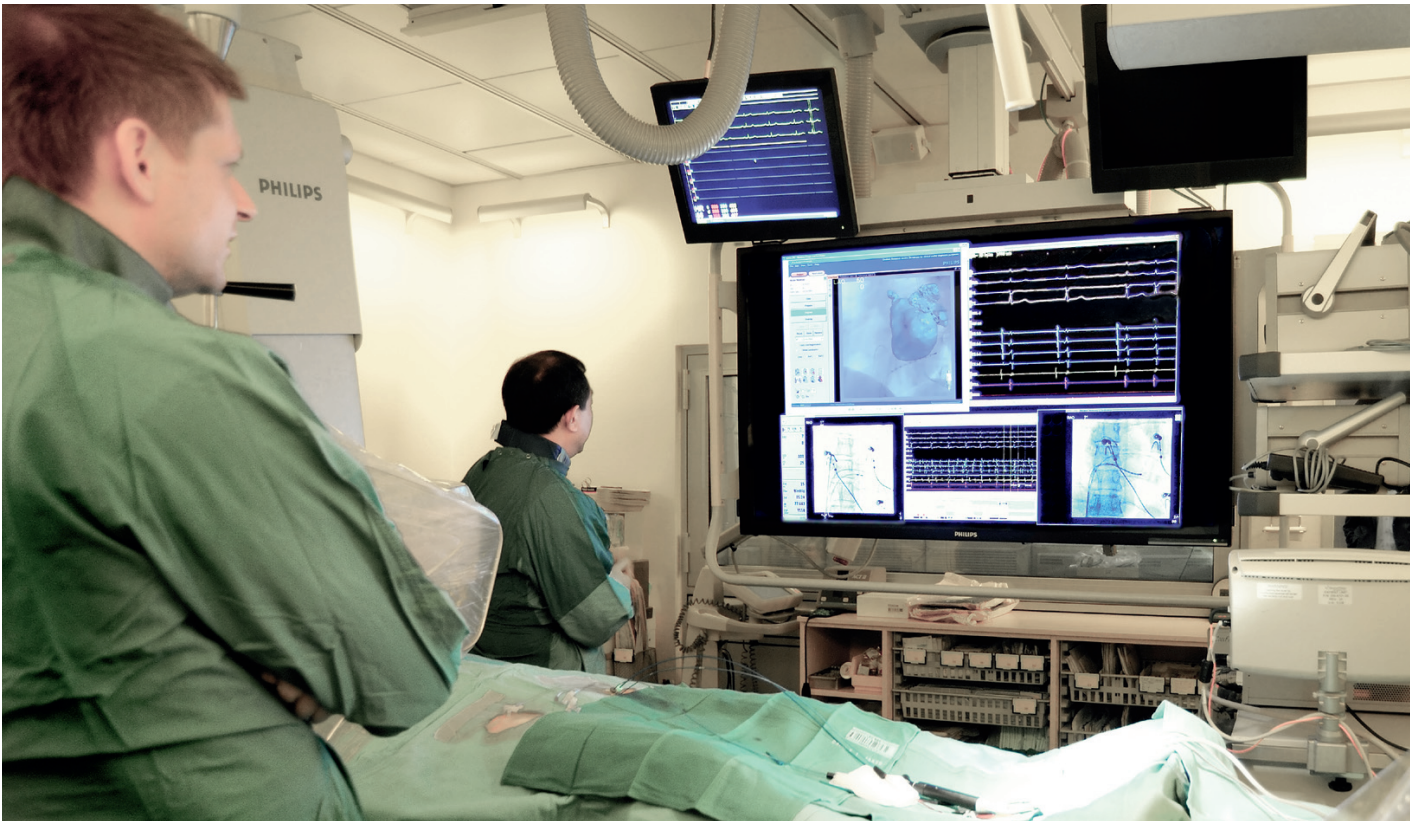
The enlarged images on the XL screen improve procedural comfort

One might think that enlarging images would mean a reduction in image quality, with images becoming more blurred or coarse-grained. This is not the case, says Goetze. On a day-to-day basis, he never has to zoom out of an enlarged image in order to increase image quality.